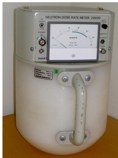
Studsvik Neutron Monitor 2202D